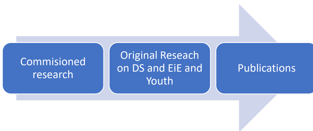
Figure 3: Research focus

Abdulahi Consulting is a research-driven consultancy dedicated to providing clients with insightful analysis through our Education and Durable Solutions initiatives. We address societal challenges, initiate meaningful change, and deliver tailored research to meet the unique needs of each client. We offer original and well curated research services that offer real solutions to client’s problems and address and inform societal changes. While our research focuses on durable solutions, Youth and Livelihoods and Education in Emergencies (EiE), we also offer solutions in other domains within the humanitarian and development spaces such as cross cutting issues including Gender and protection from Violence. Our commissioned research also focuses on issues of importance to societies, policy makers, donor and government entities